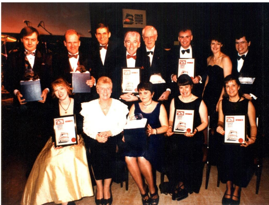
The Epsom team, with comedian Tom O'Connor after sweeping the board at the UK Coach Awards

As a multi award winning company, Epsom Coaches were well used to accolades awarded for years of quality service and innovation. They also provided judges for national industry awards events, for local awards and competitions.