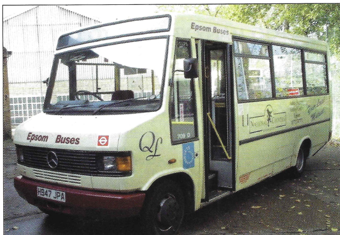
1991 Mercedes 709/Plaxton Beaver, 26 bus seats, manual gearbox.

We have the following buses for sale, available from 1st December: