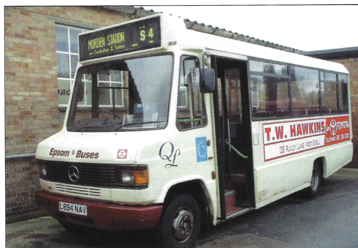
Mercedes 709/Marshall, 26 seats, manual gearbox.