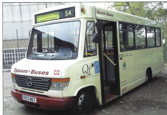
1997 Mercedes 0810/UVG Citistar, 26 bus seats, automatic gearbox.