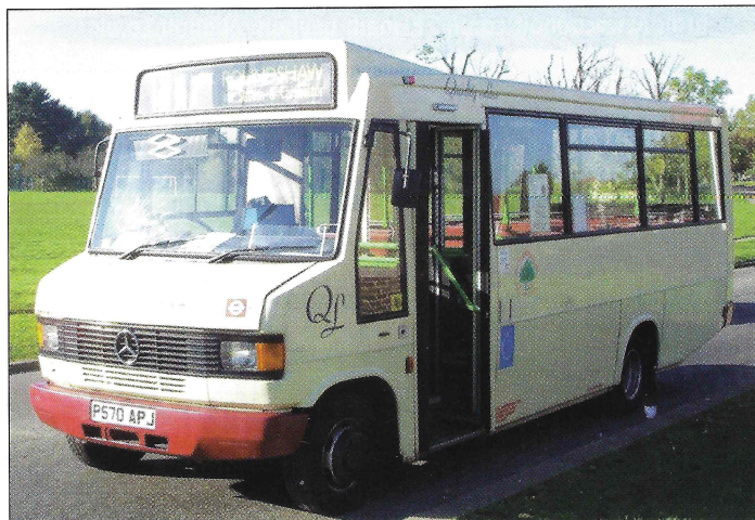
1996 Mercedes 709/Plaxton Beaver, 26 bus seats, manual gearbox.