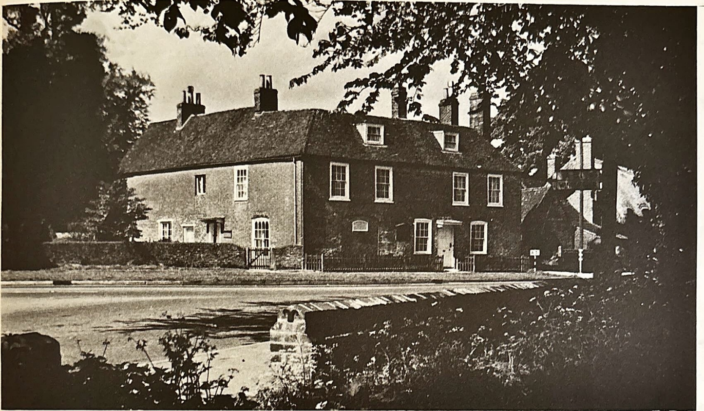
Jane Austen's Home, Chawton