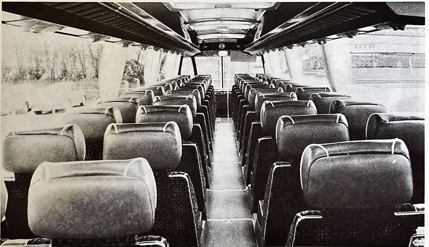
Interior of a 57 seater luxury coach