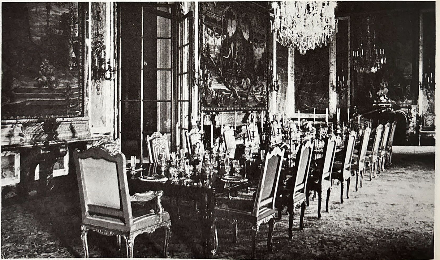
Dining Room, Luton Hoo