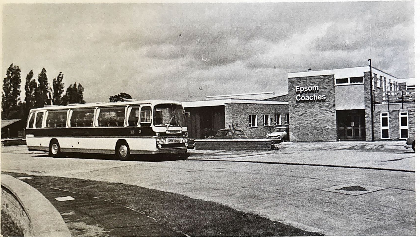
Garage in Epsom